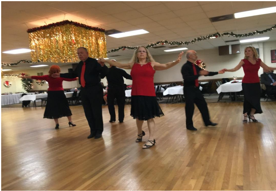
◀ Dance In Class Performance Team