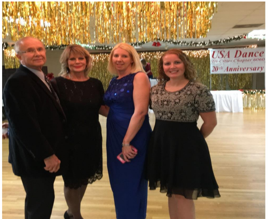
More 20 th Anniversary Scenes