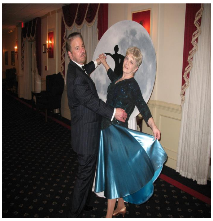
Dance by the Light of the Moon