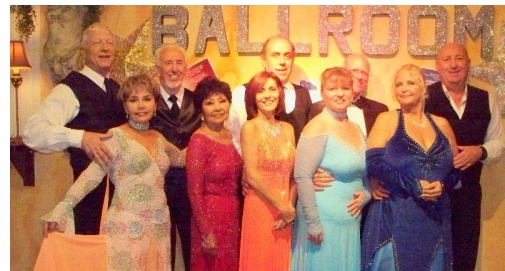
Last Years Dancers from Chapter 6049