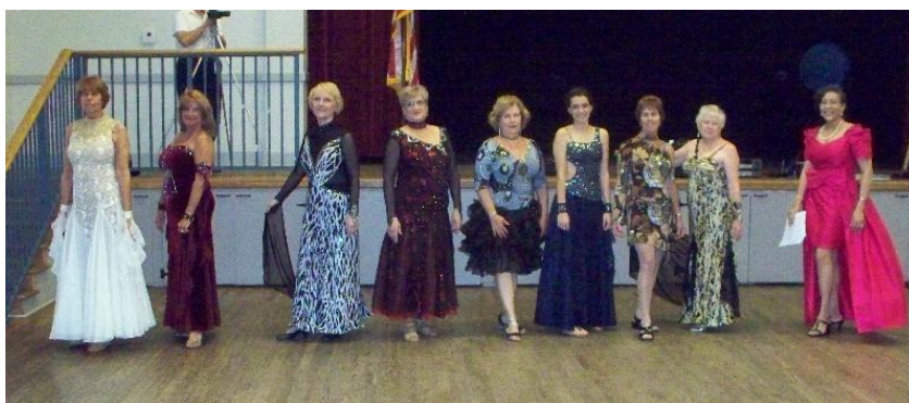
The "Riverside Ladies".