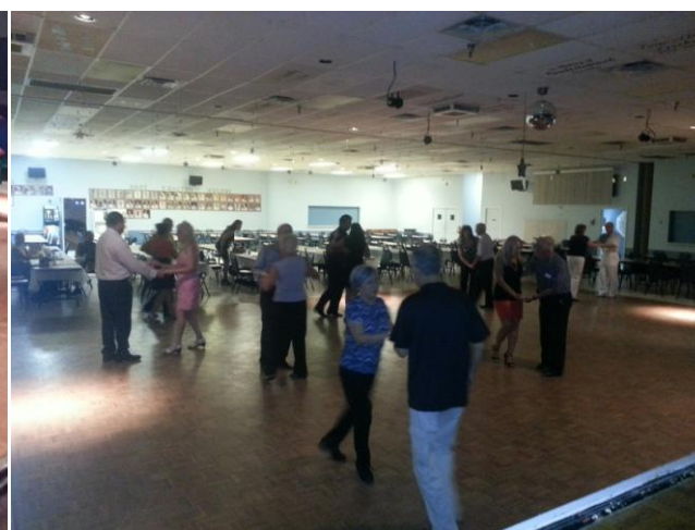
Dancing at the Elks