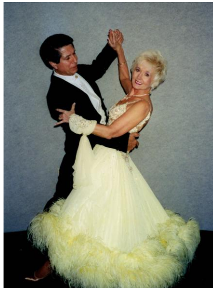
That lovely yellow gown