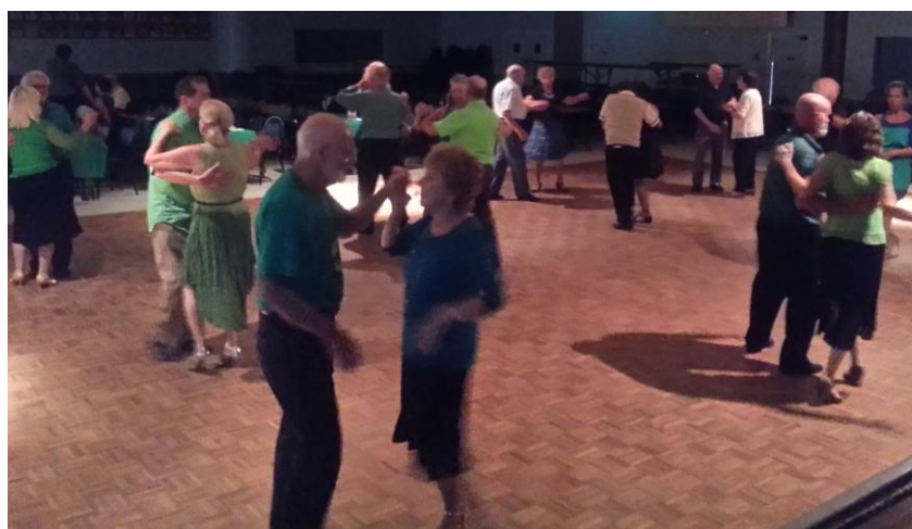
Dancing at the Elks