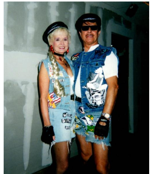
Bikers at Halloween