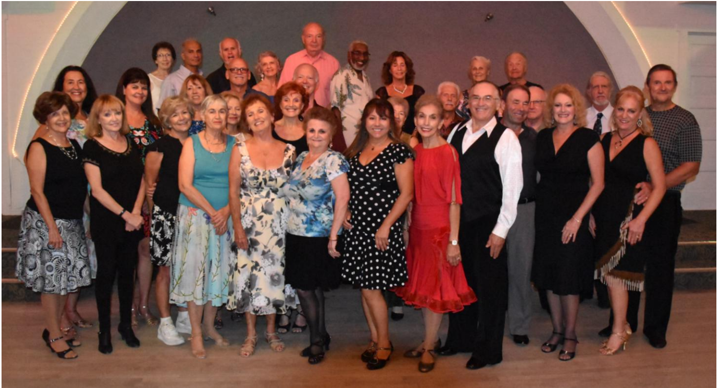
Suncoast And Adventure Coast Chapter Members