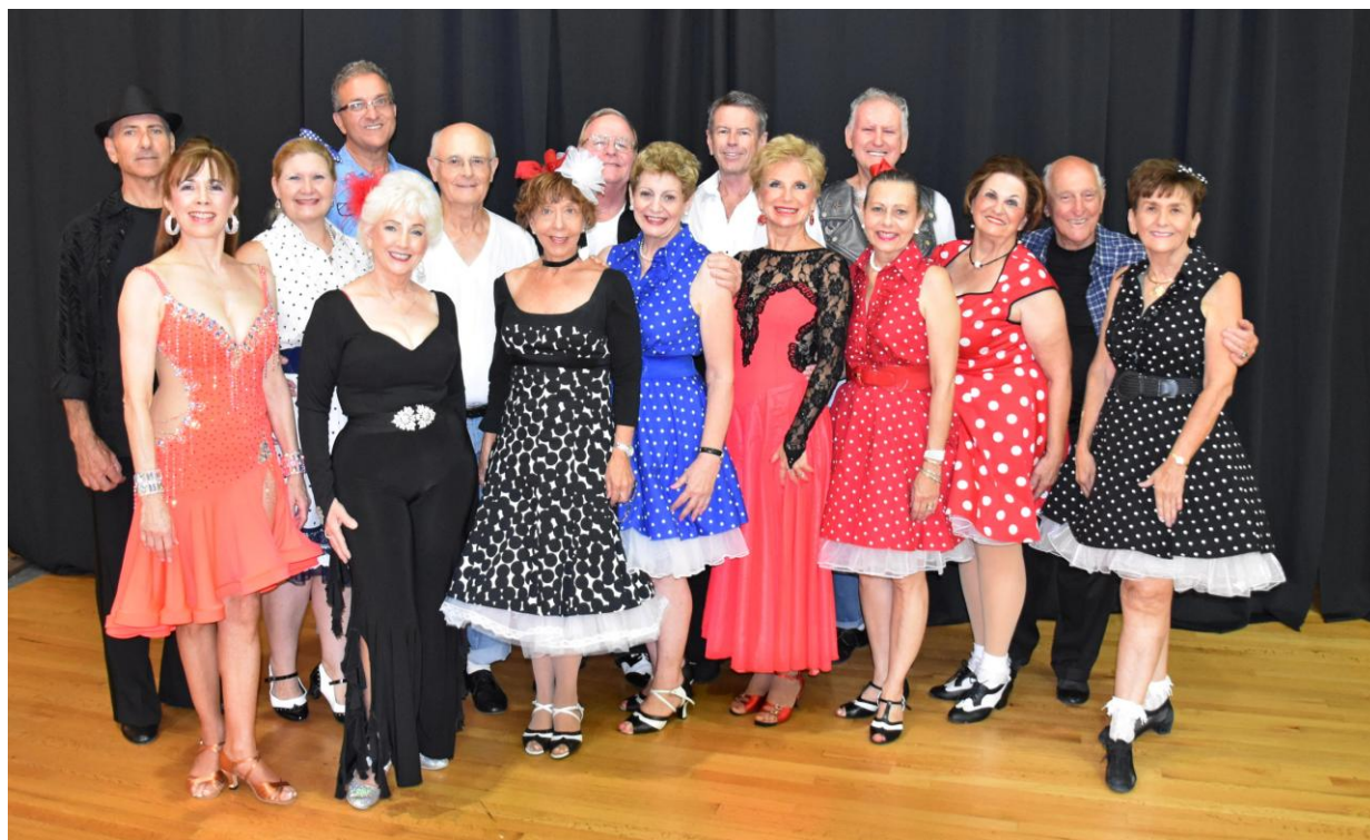
White Sands Chapter Performers for the Show