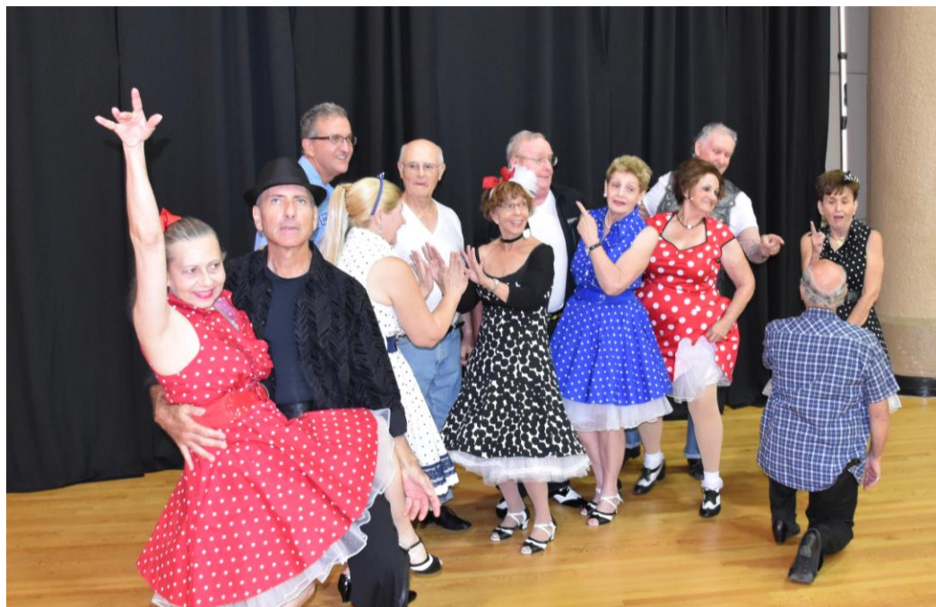
White Sands Chapter Swing Formation Team