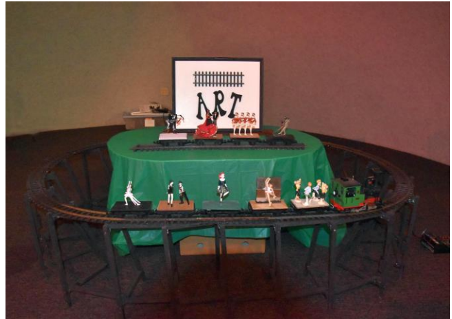
Don Koeller's Model Train #2