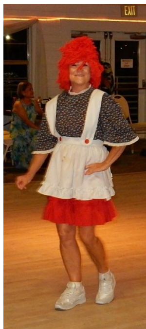
Raggedy Ann Susie