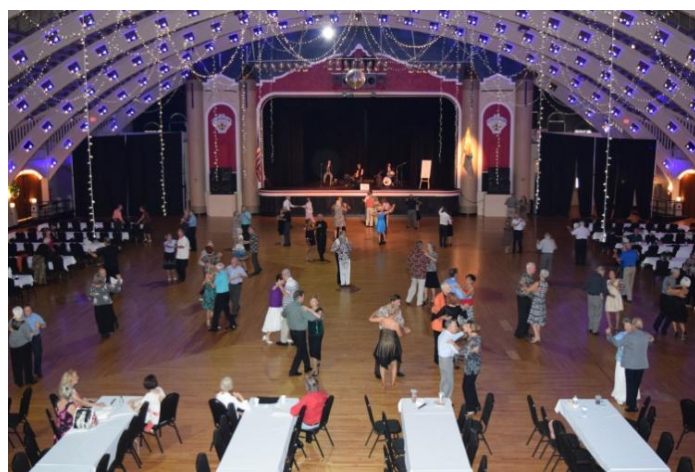
Such a beautiful, elegant ballroom!