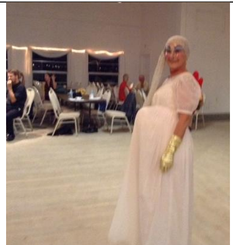
Fallen Angel Essie