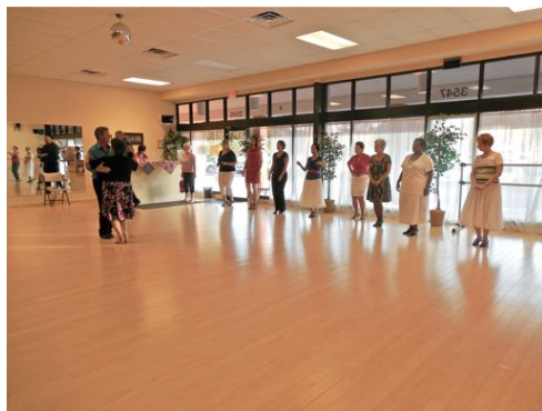
Celebrating Freedom July 5, 2014