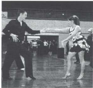
Rhode Island College competitors at Intercontinental DanceSport Festival