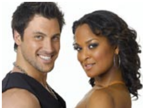
Dancing with the Stars competitors Maksim Chmerkovskiy and Laila Ali, undefeated world boxing champion and daughter of Muhammad Ali

Another season of Dancing with the Stars premiered in March on ABC. The series web site is a fun place to visit: http://abc.go.com/primetime/dancingwiththestars/ You can replay shows, read the stars' bios and even download an elimination chart to keep track of the competition. Nice closeup pix of the dancers, too.