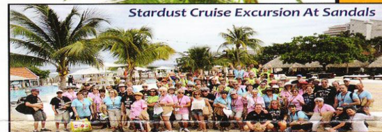
Stardust Cruise Excursion At Sandals