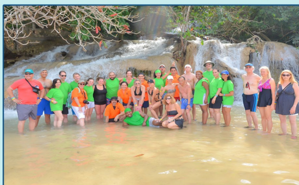
DUNNS RIVER FALLS, JAMAICA EXCURSION

Join Stardust for our 17th Ballroom Dance Cruise Caribbean fantasy with dancing under spotlights, sunlight, moonlight and the stars. Our finest instructors, performers and dance hosts will be joining us for a 10 night celebration where friends, old and new, can enjoy the amenities of a luxury ship along with our hallmark dance classes, dance sessions and top entertainment.