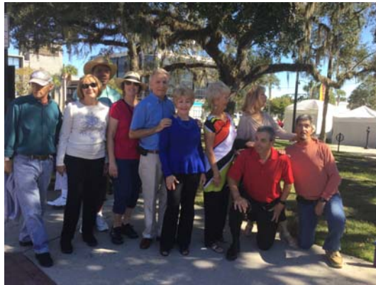
USA Dance Ocala Outreach FAFO Downtown Square Ocala