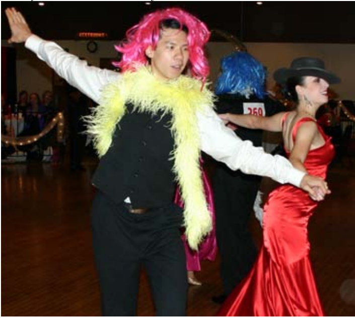
Photos from Minnesota Madness