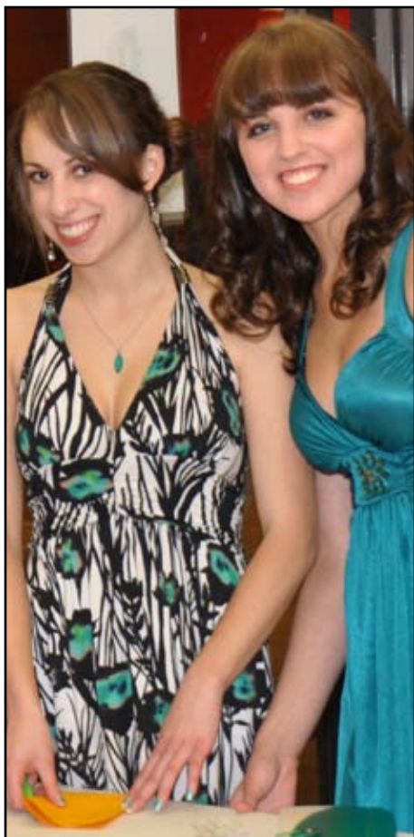
More photos from October's dance on page 20!