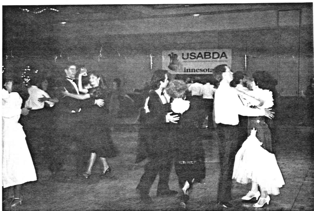
Right: Dancers enjoying the Grand Ball