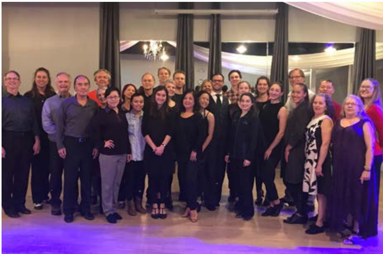
USA Dance workshop participants.