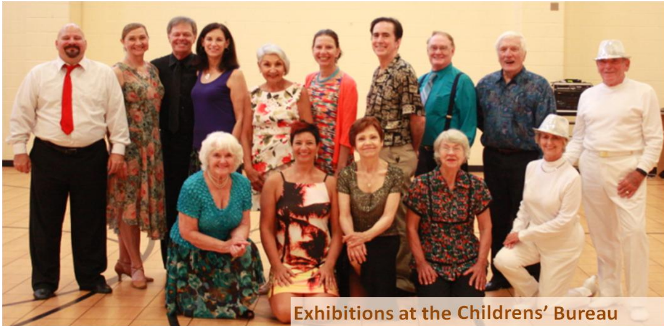
Exhibitions at the Childrens' Bureau

Children's Bureau, Inc. | Gene Glick Family Support Center”