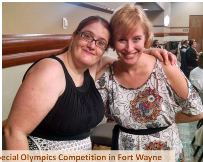
Special Olympics Competition in Fort Wayne