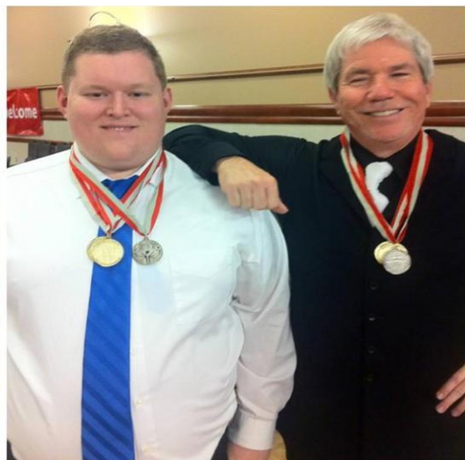
Heartland Dancers and SO Athletes in Fort Wayne, 1 Aug 2015