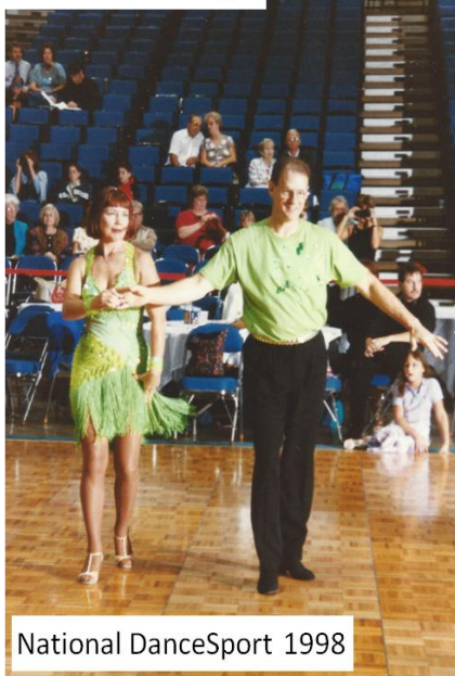
National DanceSport 1998