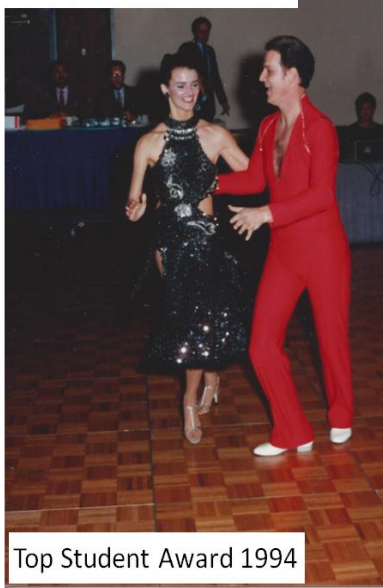
Top Student Award 1994