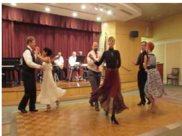
Group at Marquette Manor