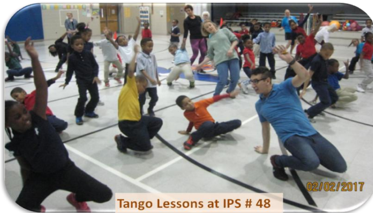
Tango Lessons at IPS # 48

On Thursday, March 9 Heartland's first D.A.N.C session with IPS #48 will culminate in Showcase celebration with the parents , during which the students will present their dance routine. Some of Heartland dancers will present their dance routines as well. The celebration will take place at the school gym ( 3445 Central Ave, Indy ), from 1:30-2:10pm . Parking is at a church across the street. We are working with the school Public Relations' Division to see if the local news coverage of the celebration is possible (Channel 13, Indy Star).