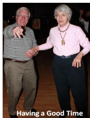
Having a Good Time