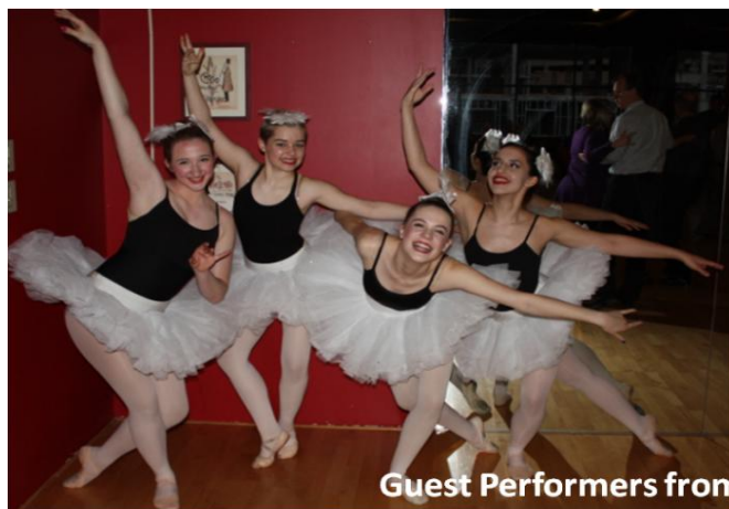
Guest Performers from Village Dance, Zionsville