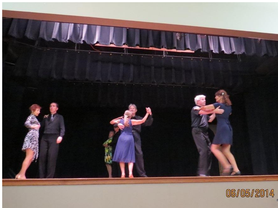
Dancers at St. Luke's Elderberries group on June 5.

usadancelakeshore.org - USA Dance Lakeshore Chapter