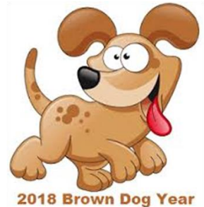
2018 Brown Dog Year

We set January 27 th as our "snow" date in case of bad weather (but we sincerely hope that we won't have to use it).