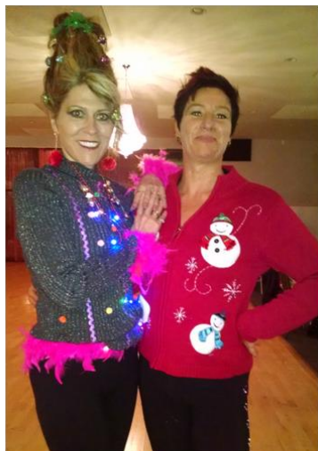
Winners of the Ugly Sweater Contest, Carmel Ballroom, Dec 2016

"To all of you dedicated volunteers who share your time with your chapter, we hope you understand how much your efforts matter. There are many thousands of people across the country who have been exposed to the joy of ballroom because you were willing to share your time, your talents and ideas with your USA Dance chapter. You worked to create beginner lessons, social dances, public demonstrations, and outreach programs to introduce young people to dance.