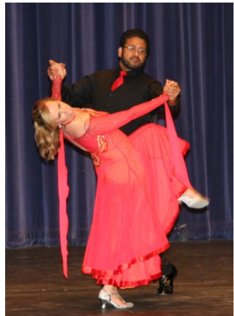
Dancing_Waltz at the Greenfield Fundraiser for Homeless Shelter