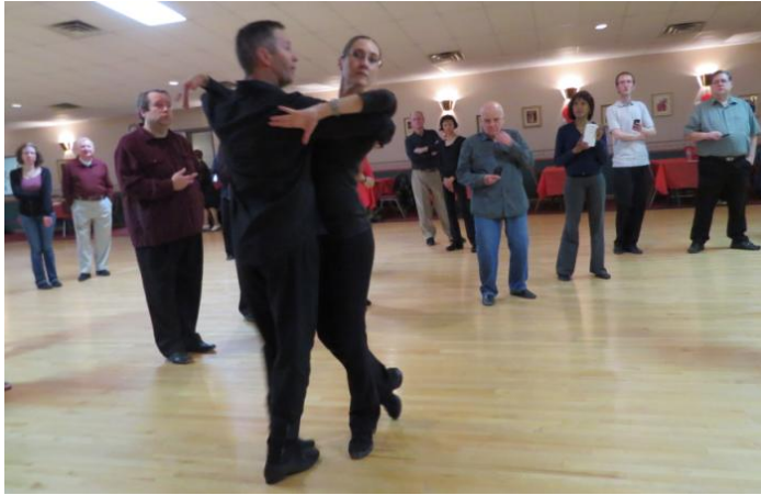
A demo during the Heartland workshop, January 2015