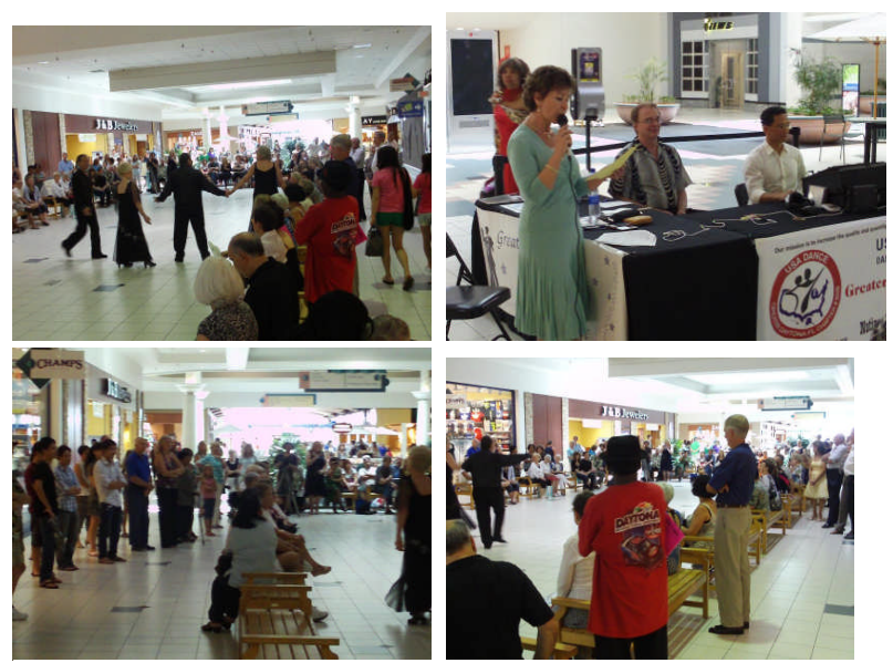
Mall Ball Sunday 9/16

Videos of the Mall Ball can be seen on Youtube and have been added to our website.