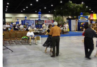
Home Show- Saturday