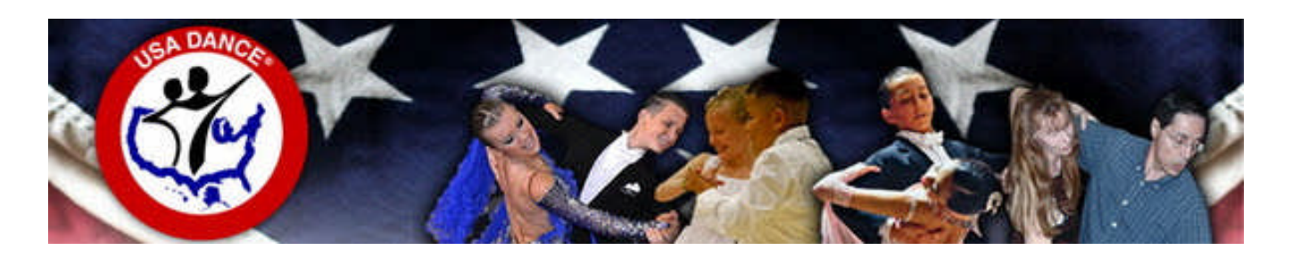
Greater Daytona Chapter USA Dance, #6026, www.greaterdaytonachaper.org, Daytona Beach area, FL 32119

\underline{\mathsf{SafeUnsubscribe}}^{\mathsf{TM}} \ \{\mathsf{recipient's\ email}\}