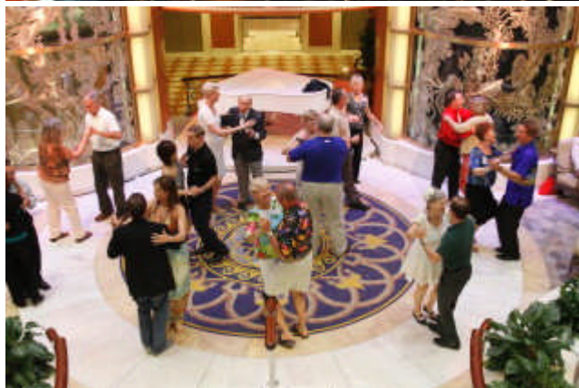
Dancing in the Piazza