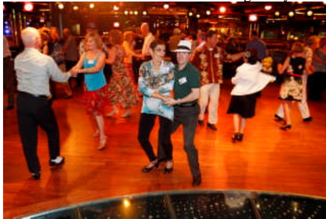
Dancing in Club Fusion