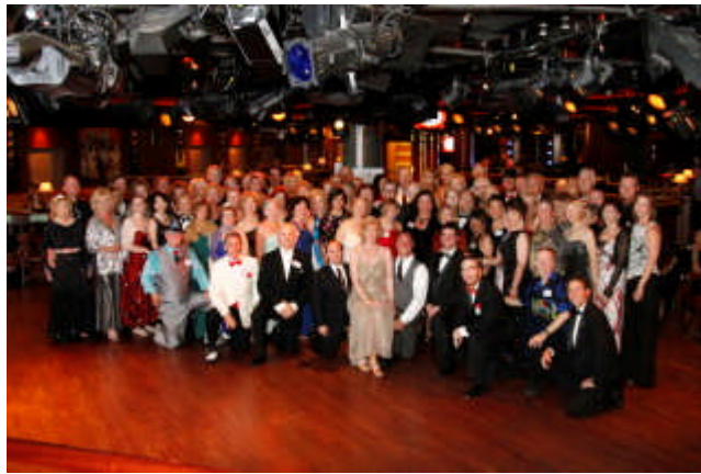
The entire group on formal night