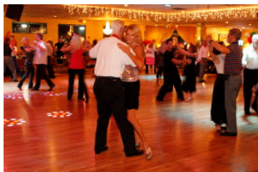
Dancing at the Goldcoast Ballroom

We had some fun theme nights and a final cocktail party to say our thanks and goodbyes. See some photos below. We would love to have you join us on the next cruise.