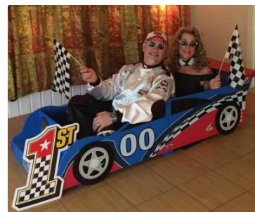
Ease on over to the Dance Spree

We would love to have our members join us for this fun weekend event.