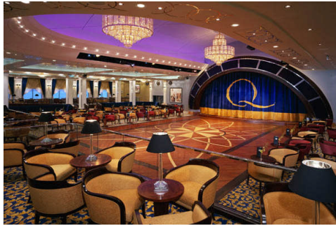
Picture yourself dancing in the Queens Ballroom.