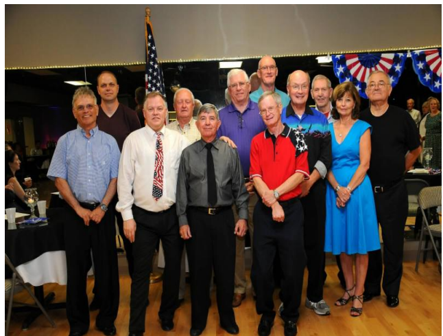
Tribute to the members who served in the Armed Forces