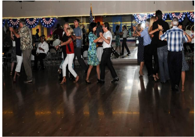
Saturday Night USO Party Foxtrot Lesson