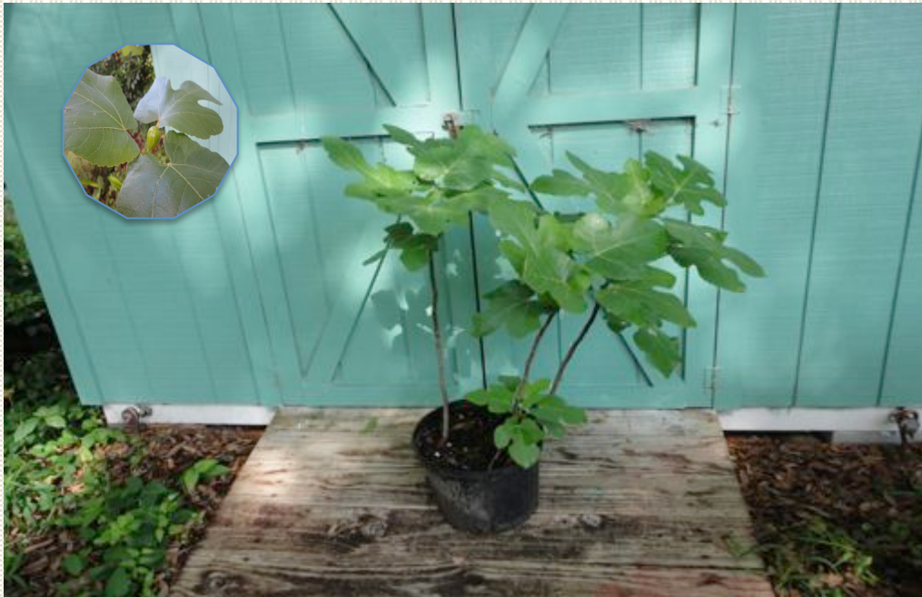
Fig trees are easy to grow! The fruit can be eaten fresh or used for cooking and baking. Fig trees do well in containers and in almost all types of soil. They can be kept as small as 6' with regular pruning.