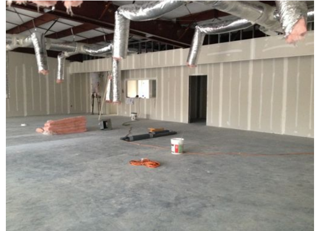
November 24 Ceiling is up - painting