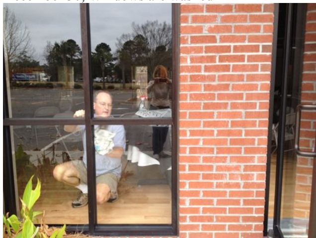
December 30 More installation