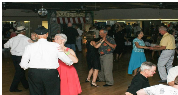
An Evening in Paris - a great party with a lot of fun dancing!